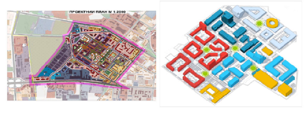
Fig.2. Models of the city territory functional planning organization: Industrial city. Vysneve; 2) Innovative city. Masdar; 3) Innovative city. UNIT.City